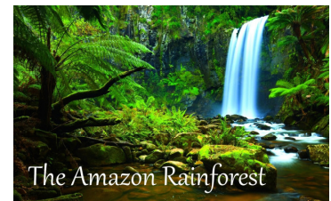
The Amazon Rainforest