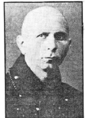
Trebitsch Lincoln, alias Abbot Chao Kung, Shanghai, 1931.

Trebitsch Lincoln spent his last months in a Shanghai YMCA preaching Buddhism. His last interview was with a Jewish newspaper, in which he outlined a plan for a settlement of Jewish refugees near Shanghai, which he envisaged as "a miniature Tel Aviv." Trebitsch died in 1943.